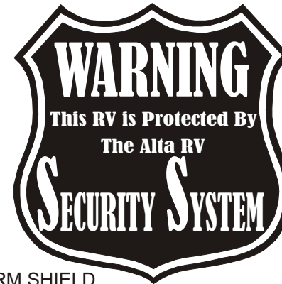
ALARM SHIELD (EXTERIOR STICKER)